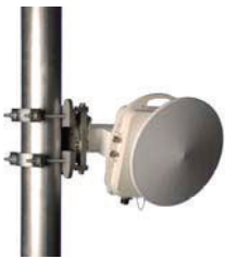
GigaLink 64xx MMW Transceiver